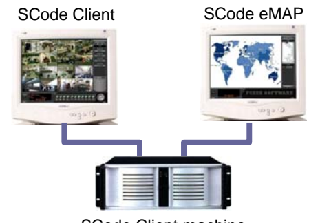
SCode Client machine

SCode Client program supports dual-monitor operation.